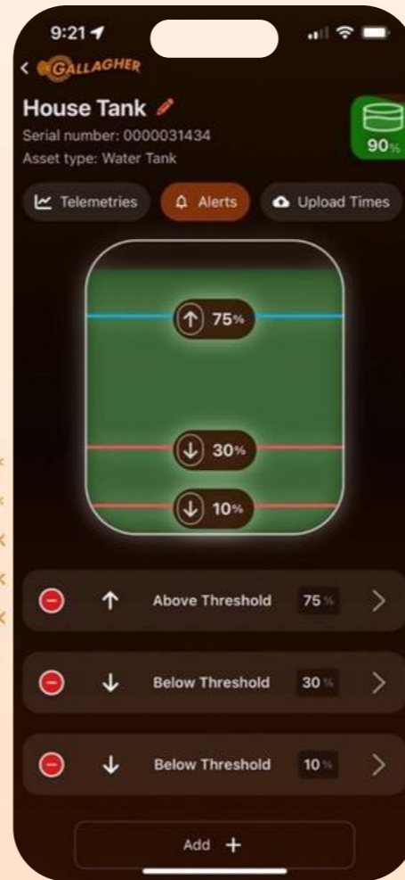
Custom alarms & notifications