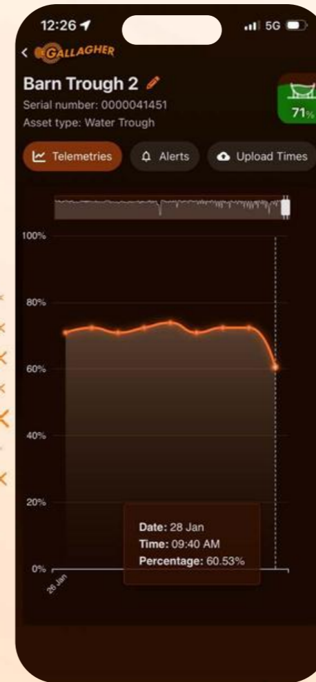
View usage history